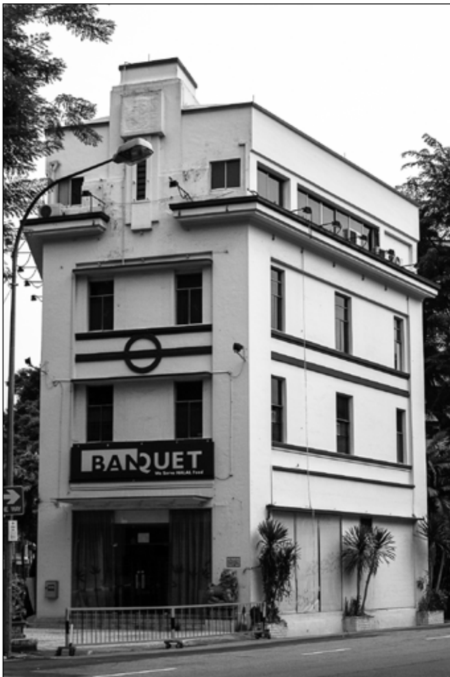
The former Tiger Balm Building in 2010