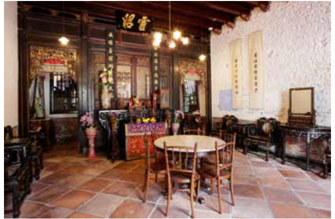
Reception hall of 157 Neil Road, featuring the altar to the household deity at the centre

There are many more examples of the ways in which changes in the area, personal memories and the everyday needs of the family constitute new layers woven into the complex tapestry of the NUS Baba House. Accordingly, 30 years after the house was vacated by the last generation of occupants in the 1980s, the introduction of the conservation project required an ‘interpretative’ aspect in addition to its ‘restorative’ elements. This was undertaken by NUS in 2007,