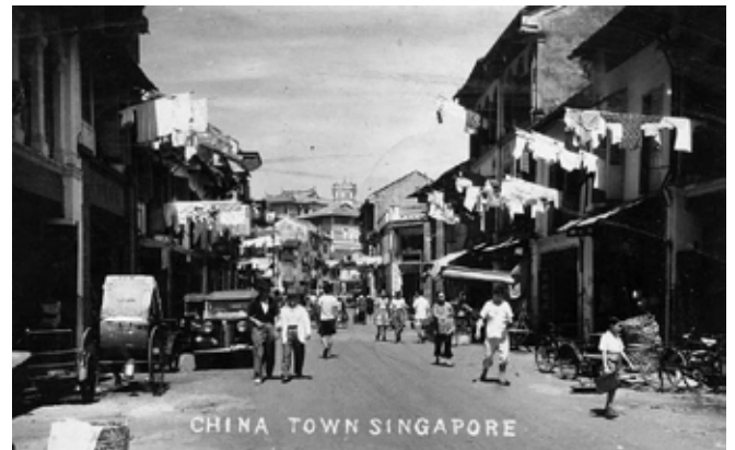
Kreta Ayer in the 1930s

The town expanded towards the Singapore River and divided into separate areas for the Hokkien, Cantonese, Teochew and Hakka dialect speakers to live. Many of these streets were no-go areas for people from a different dialect group and were controlled by secret societies.