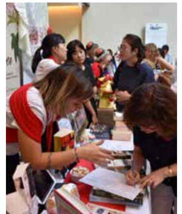
Signing up for the best thing you ever did for yourself

So if you have always wanted to be a docent, acquire the knowledge you've always wanted to have and pick up valuable speaking skills along the way, apply at www.fom.sg and come join the vibrant FOM docent community.