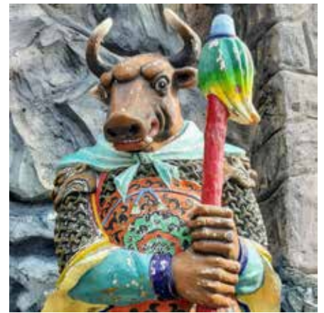
"Horse-Face", standing guard at the Ten Courts of Hell

During the peak years from 1949-1953, over 80 artisans worked on Haw Par Villa's displays. The figures and scenes that filled the gardens were initially shaped using reinforced steel, then covered in concrete. Before the concrete dried, wire mesh was used to create a more accurate shape. The lead artisans then worked a layer of plaster to create each statue's