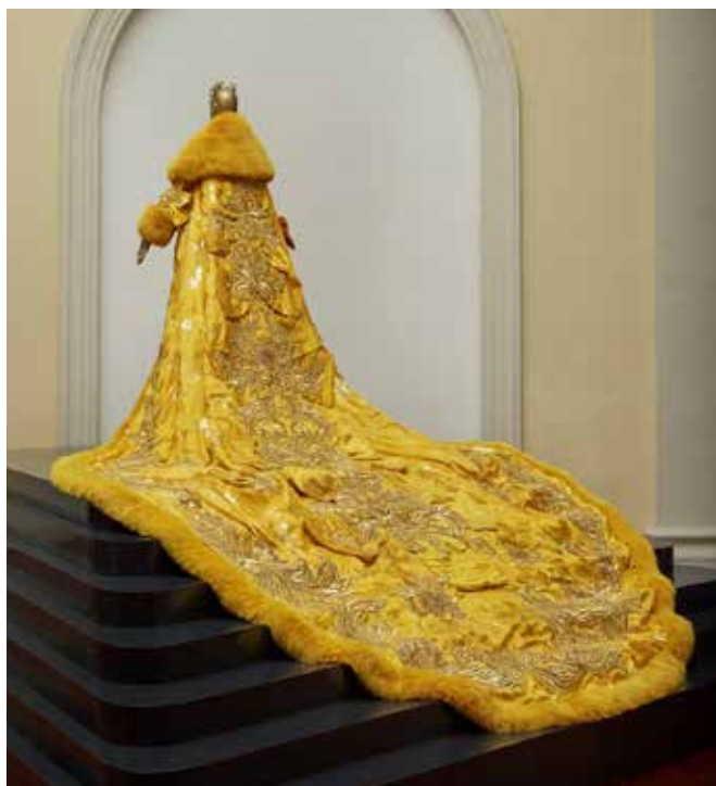
The majestic embroidered cape of bright yellow silk worn by Rihanna

Against the grim backdrop of the Cultural Revolution in China, a grandmother whispered bed-time stories to her granddaughter. She spoke of the imperial elegance of a bygone era, fantasies in silk and satin, rich embroideries of luscious flowers, fluttering butterflies and shades of delicate pinks and vibrant yellows. In the little girl's grey universe the coarse cotton Mao suit was the norm, having fashionable attire was a criminal offence, so these sartorial descriptions were the stuff of dreams. She would fall asleep imagining the smoothness of silk and flowers made of thread, but would have to wait till she was 16 before she saw an embroidered dress for the first time. The girl's name is Guo Pei and to this day she is still chasing those elusive images of beauty and opulence.