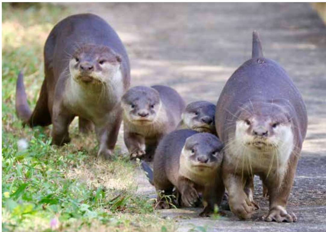
Pups stay close to the adults for the first few weeks

Singapore is probably the only country in the world where you can see otters in broad daylight, right in the very heart of the city. Search the internet and you can find documentaries narrated by Sir David Attenborough, amongst others, with captivating footage of otters swimming in the Singapore River, rolling in the sand on the shores of Marina Reservoir and even parading their pups in Pasir Ris Park.