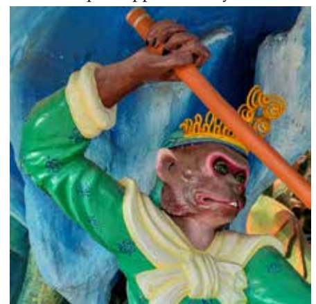
The Monkey God mid-battle