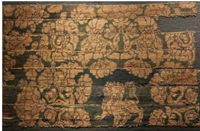
This Liao Dynasty textile (907-1125) features roundels encasing four eagles. Facing bird and animal motifs are amongst the oldest textile designs found in Central Asia, which were adopted by the Chinese

the collection of the Palace Museum, Taipei). Recently, archaeologists found what they now believe to be China's earliest carving depicting silkworms, a boar's tusk carving found in Henan province that dates back 5,000 years. 3 ACM's small Han Dynasty bronze silkworm is young by comparison.