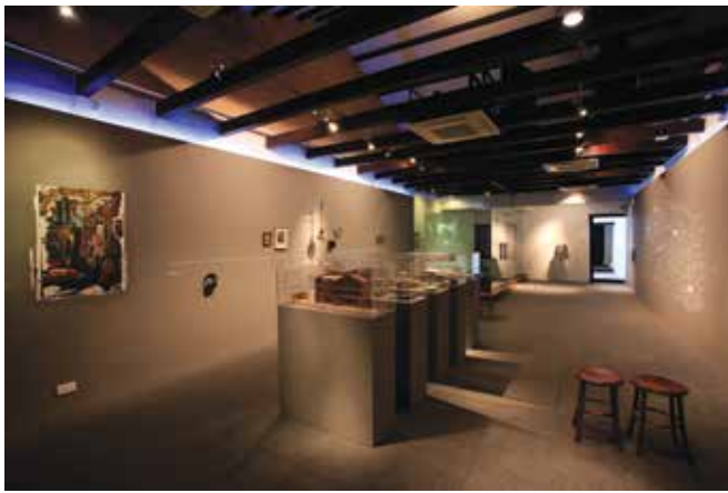
Gallery impression of Glossaries of the Straits Chinese Homemaking