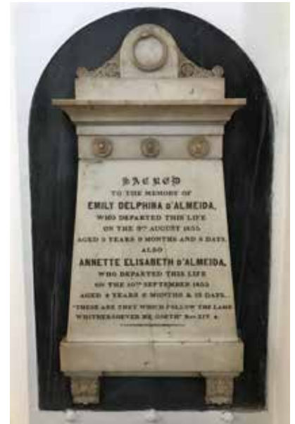
The D'Almeida family's double tragedy