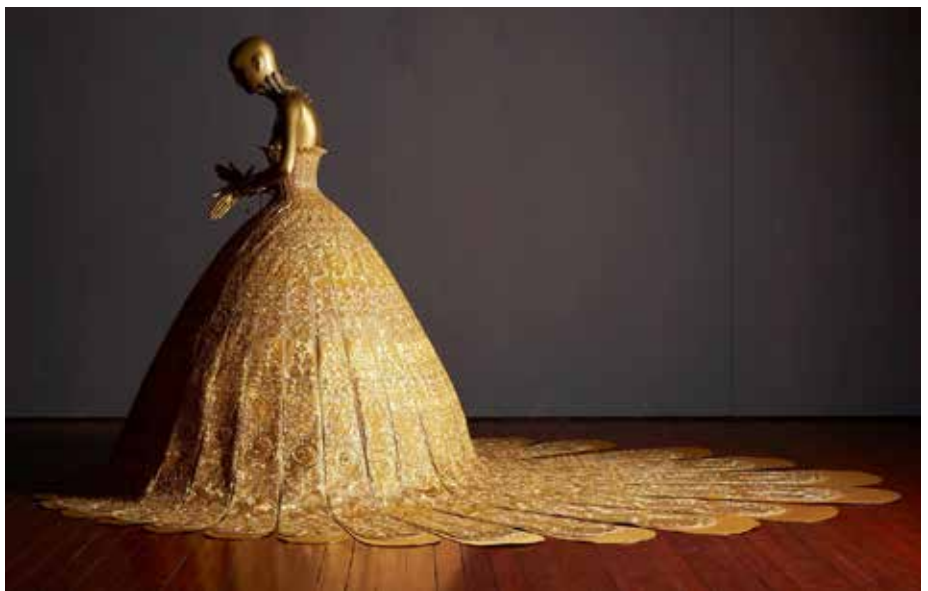
The magnificent gold dress (Da jin) that took 50,000 hours to complete in genuine gold thread

Today Guo Pei has the freedom to satisfy most of her artistic whims, but this was not always the case. The financial structure of couture houses is as delicate as are their products; their sine qua non is one of excellent craftsmanship and absolute luxury, which means they cannot employ economies of scale and the mechanisation that enables other industries