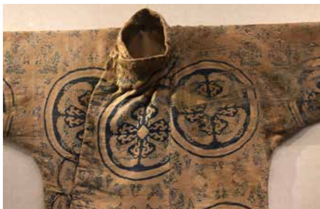
A beautiful piece of Tang Dynasty (618-907) Samite silk with standing lions. Samite is the name given to luxurious and heavy woven silk fabrics

The Chinese have led the way in sericulture and silk production since at least the Neolithic Era (5000 BCE). We have pottery shards showing silkworm patterns as well as carvings, and even a cut cocoon discovered by archaeologists dating to the Yangshao Culture, circa 3500-3000 BCE (in