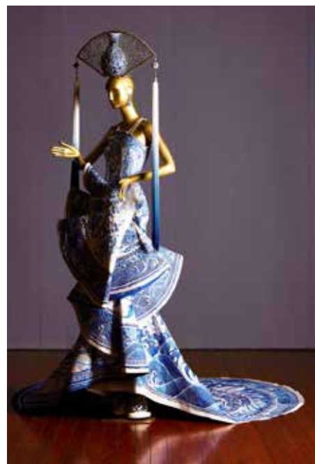
The Chinese blue and white porcelain dress

exhibition of Guo Pei's work, consisting of fantastical gowns encrusted with Swarovski crystals and sequins, embroidered with golden dragons, phoenixes and thousands of flowers, is here to open the Season of Chinese Art at the ACM. Multiple pieces are displayed in three sections: Gold is the Color of my Soul, China and the World, and Treasured