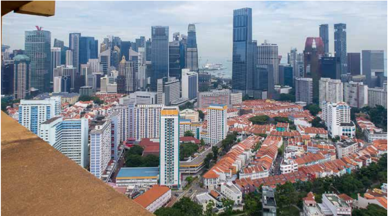
The block offered great views - this is from one of the penthouses

The time has come to bid farewell to Pearl Bank Apartments, that cylinder-shaped apartment block that sticks, like the proverbial sore thumb, out of the southern slope of Pearl's Hill. Touted as Southeast Asia's tallest residential building during its construction, the block is thought of as a marvel of modern design and architectural innovation, in spite of a rather unpretentious appearance. Emptied of its residents, the block now awaits its eventual demolition. It was sold in February 2018 as part of a wave of collective sales that threatens to rid Singapore of its modern, post-independence architectural icons. CapitalLand, the developer behind the purchase of the property, aims to replace the block with a new development that will have close to 800 units, compared to Pearl Bank Apartments' original 288 units.