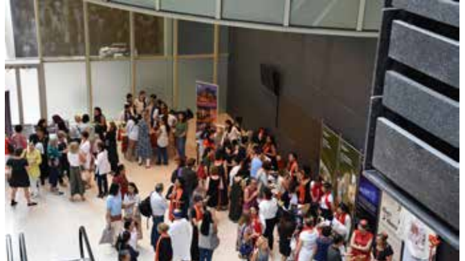
Inhabiting the NMS canyon again

We held our annual Public Information Meeting (PIM) on 16 May. As usual, all the museums offering training programmes during the next 12 months were out in full force. Each was represented by beautifully decorated tables and manned by enthusiastic docents, mostly newly minted ones. We welcomed about 100 attendees keen to find out more about FOM's docent training programmes and were very happy to note that a significant proportion of the audience was new to FOM, a potential pool of new members we could induct into the FOM fold.