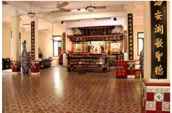
The temple on the second floor dedicated to the goddess Mazu

(1260-1368). All the stories feature Confucian moral values, which fit perfectly into the concept of ancestor worship.