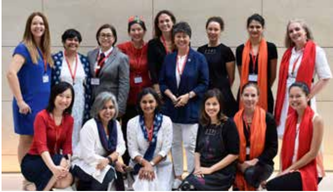
The PIM Team – OHOs and co-heads