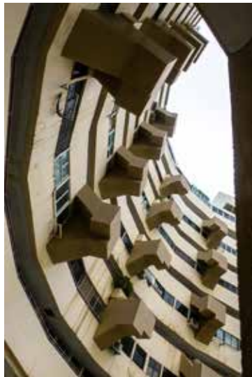
A perspective of the apartment block's unique design

Uniquely shaped, the block stands on a C-shaped plan with a slit that runs down the cylinder and provides light and ventilation. The inside of this cee is where the complex and quite creative nature of the building's layout becomes apparent, as does its charm. Common corridors line the inside of the circle, providing correspondence across the entrances of the split-level apartments and also to each apartment's secondary exits via staircases. These staircases are appended to the inner curve and provide breaks in its shape – as does a common staircase shaft that serves as an emergency escape. The apartments are a joy in themselves, each woven into the neighbouring unit across the different levels – much like interlocking pieces of a three-dimensional puzzle and providing a joyous mix of two, three and four-bedroom apartments.