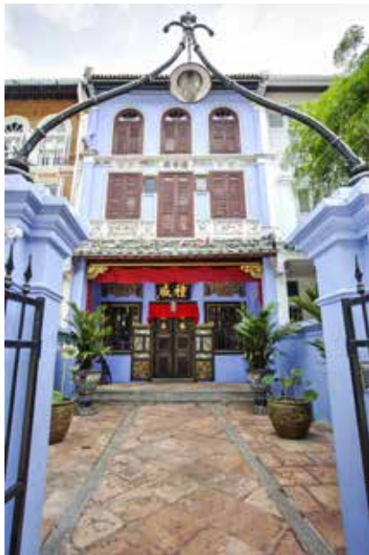
Laundry blue exterior of the NUS Baba House

its connection with the Wee family, descendants of shipping tycoon Wee Bin, began in 1910 when they acquired it. In the decades since, the house has seen continuous development as it evolved to meet the needs of its occupants, thus also reflecting the changing times. Wee Lin, one of the surviving family members, has a clear memory from when he was still in primary school, that a back lane was constructed behind the house.