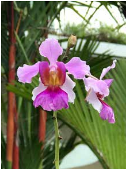
Vanda Miss Joaquim orchid

The fourth area of Tanjong Pagar (cape of stakes) developed for a different reason. The original port in the Singapore River became overcrowded and could not cope with the burgeoning trade. A new port needed to be built and the urgency of this was exacerbated by the change from sailing ships to steam ships in the middle of the 19 th century. The New Harbour (later renamed Keppel Harbour) was located at the end of Tanjong Pagar Road, which became a busy thoroughfare between the port and the godowns or warehouses alongside the Singapore River. All manner of vehicles rushed up and down: rickshaws, hand-pulled carts, bullock carts, pedestrians, horse-drawn vehicles and later steam, followed by electric, trams. A branch railway line was constructed between Keppel Harbour and Tank Road, but was dismantled after a few years and is now our first 'green corridor', Duxton Plain Park.