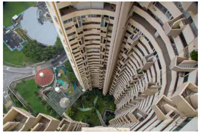
A view from the top

involved the lifts occurred later in November 1986. A metal chain of one of the lifts fell a hundred metres and crashed through the top of the lift's cabin. It was quite fortunate that there was no one using that lift when the late-night incident occurred. The building also developed a host of other problems as it aged. In its later years, it has also taken on an increasingly worn and tired appearance. Even so, it was still one to marvel at and one that excited many in the photographic community – particularly owing to its unusual and quite photogenic form.