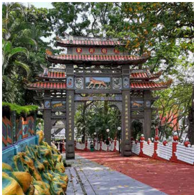
Haw Par Villa's entrance arch, as it appears today

See the Ten Courts of Hell , but there is so much more. The displays of Virtues and Vices also depict the importance of living a moral life, minus the gore and with greater quality and detail. In the grottoes and statues of Journey to the West , you'll see the tale of a holy monk and his disciples, who encounter the deceptively charming Spider Spirits on their journey to obtain Buddhist scriptures. Then there are the intricately detailed statues of the Battle of the Yellow River ,