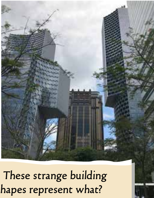
9. These strange building shapes represent what?