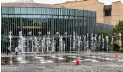
The main entrance of the China Silk Museum in Hangzhou

The Hangzhou Museum together with its sister museum (the Suzhou Silk Museum in Jiangsu) were founded in the 1990s when pre-Song dynasty textiles began to be found amongst the tomb artefacts