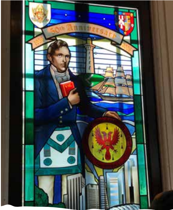
8. We all know who this man is, but where is this window found?

Explore Singapore! is taking a short break over the summer period, but look out for our next tour, which will be on 29 August.