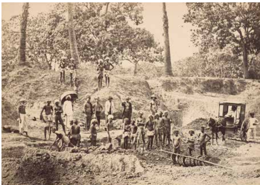
Indian convict construction workers

Most of the lives honoured in the cathedral were short by today's standards. Very few lived beyond the age of 60. Of these, it is worth mentioning two whose long lives