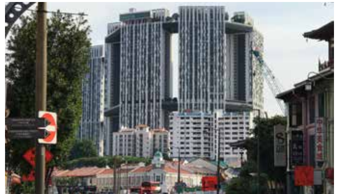
Conserved buildings beneath modern high-rises

The old shoreline of Telok Ayer Bay disappeared with the levelling of Mounts Erskine and Wallich and the land reclamation that took place in the 1880s. The sea and the ships have receded into the distance. The Chinatown we see today still contains glimpses of the past, but in order to appreciate the contributions made by all the different communities who came here long ago, we need to look between the cracks of this modern city to see the sacrifices made, the hard labour involved, the money donated by philanthropists and the lives lived by ordinary citizens, during the establishment of this unique and diverse part of the city.