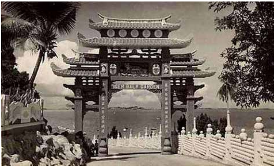
Haw Par Villa's entrance gate in the late 1950s, with a clear view of the ocean

Haw Par Villa is a little rough around the edges in some spots, but this may reflect the sheer amount of statuary it contains. The exhibit that seems stamped on the memory of every Singaporean who visited as a child – and also every travel blogger -- is the Ten Courts of Hell . A group of figures vividly depicts gruesome punishments for misdeeds ranging from the misuse of books to corruption, as the dead travel through hell en route to reincarnation. The emphasis is on gore, with the apparent intention of making a strong impression. Indeed, the impression may linger subliminally after you leave the exhibit. On recent visits, the aforementioned music playing throughout the gardens included such tunes as I Don't Stand a Ghost of a Chance with You , Let's Face the Music and Dance , and – in a wonderful, if unintentional nod to the exhibit's reincarnation theme – Happy Days are Here Again .