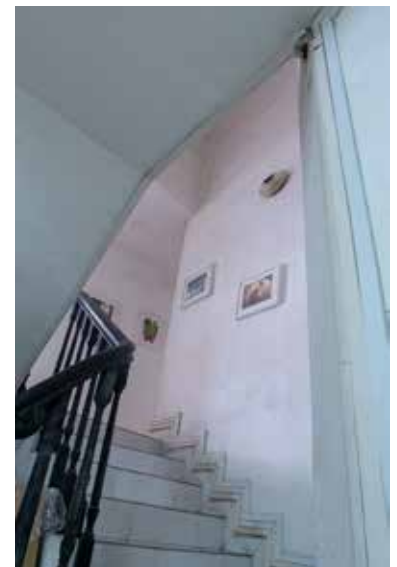
The block's apartments were laid out across several levels and were woven into each other much like interlocking pieces of a 3D puzzle

Plans announced by CapitaLand in mid-May confirm that nothing more than the memory of Pearl Bank Apartments will be retained. 'One Pearl Bank', the new development, will feature two curved 39-storey towers connected at the roof by bridges. Due to be completed in 2023, the development will also appear much less stark and a lot more 'green' – in keeping with current trends in vertical greenery. Despite being prettier in appearance and a breath of fresh air, it will take a lot more than that for One Pearl Bank to reach the heights that Pearl Bank Apartments had as an architectural and photographic icon.