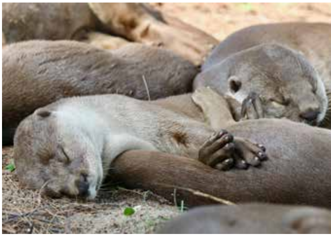
Otters enjoy each others company - even when napping