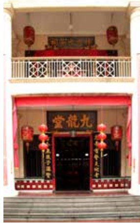
The entrance to the building

If you venture further into the ancestors' hall you will find 14 tiles depicting stories from the 'Twenty-four Filial Exemplars' a classical text from the time of the Yuan Dynasty