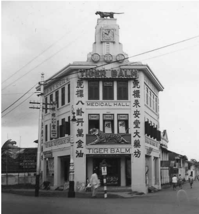
The Tiger Balm Medical Hall along Selegie Road, 1930s.