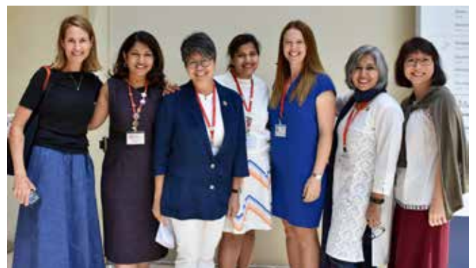
The FOM council supporting the PIM event