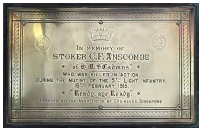
Tribute to C F Anscombe, a stoker killed during the mutiny

These were men of many talents: army officers who earned distinction by playing a multitude of roles in Singapore's development. But what of the unsung heroes who labored on the cathedral's construction? They were convicts from India who formed the labour force for all public buildings until 1873. Despite their low status they were well treated and highly regarded for their skills and industry, which they no doubt thrived on once they earned their freedom and became absorbed into the community.