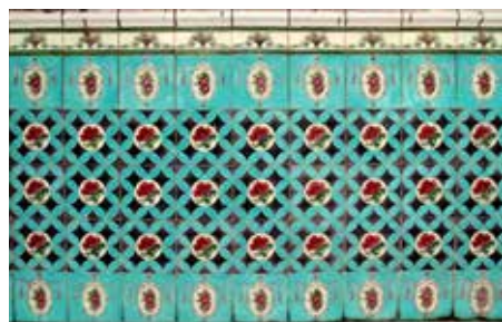
The beautiful original Peranakan tiles

If you would like to find out more about the building and Tanjong Pagar, join one of the many tours FOM/URA offers on Fridays and Saturdays. For more information and to sign up, visit www.fom.sg public events and look for FOM/URA Chinatown Heritage.