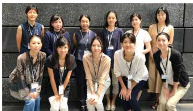
The new Japanese docents who joined in April 2019

As soon as I was informed about my second move to Singapore, I was thrilled to know that I could work with the JD community again. Now that I've re-joined the JDs, I am glad to see familiar faces and people I look up to as I continue to build on my skills. I am also extremely thankful for all the tour guide materials compiled by the past JD members now