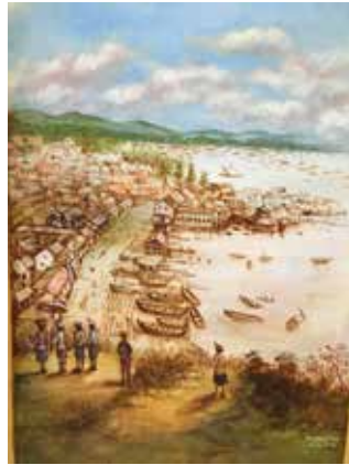
Telok Ayer Bay in 1856, from a painting by Percy Carpenter. Courtesy of the artist Yip Yew Chong

Right from its beginnings, Singapore's Chinatown was not inhabited solely by the Chinese. The thriving port city was flooded with ethnic groups from all over Asia and further afield. This is evident today in the different religious buildings constructed along the shoreline of the old Telok Ayer Bay. These have become 'National Monuments' and many people don't realise that there are more located along Telok Ayer Street than on any other street in Singapore.