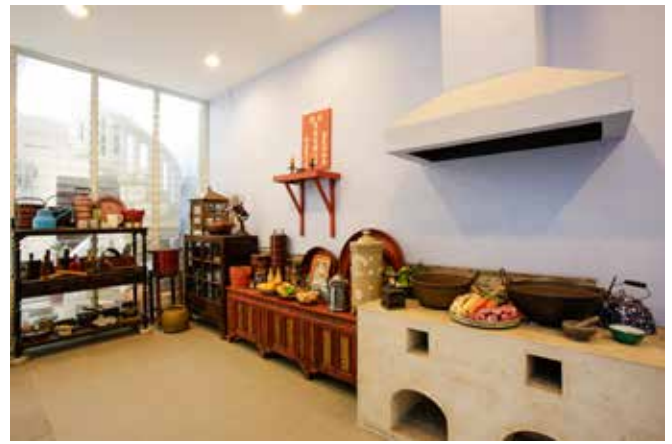
Kitchen moved over from 20 Everton Road, with access to the back lane

came from various donors, notably other prominent Peranakan families. The comprehensive collection includes lacquerware such as everyday utensils, electrical appliances, books, clothing and textiles such as batik with their decorative elements, as well as a substantial assemblage of portraits and paintings. Together, they provide a glimpse into what life for a Peranakan family might have looked like nearly 100 years ago.