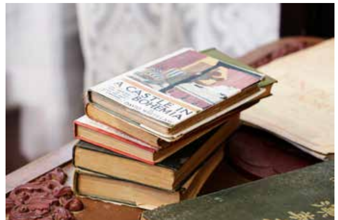
Books in the Straits Chinese collection, stored in the rear bedroom

Conferences on the Peranakan Chinese have also been initiated, culminating in two publications that are now crucial contributions to the evolving discussion on Peranakan heritage. An exhibition gallery on the third floor now takes the place of what used to function as a bedroom. Here, artists and practitioners have been invited to present their works in response to the discourses emerging from the house. The current exhibition, Glossaries of the Straits Chinese Homemaking , draws elements from similar past projects in proposing new ways of understanding the Straits Chinese heritage as one of continuous cultural negotiations.