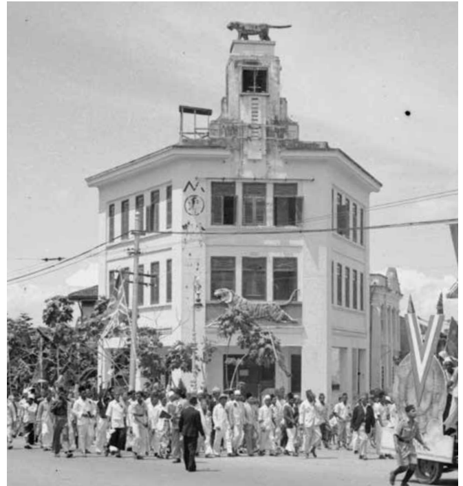
The Muslim community in Singapore hold a parade to welcome the return of the British, circa 1945. Image © Imperial War Museum (SE 5096)

The former Tiger Balm Building, which long marked the corner of Short Street and Selegie Road, is no more. Topped once by an image of a tiger as a mark of its association with the Haw Par Brothers famous cure-all ointment, it has been demolished to allow a luxury car “vending machine” to take its place.