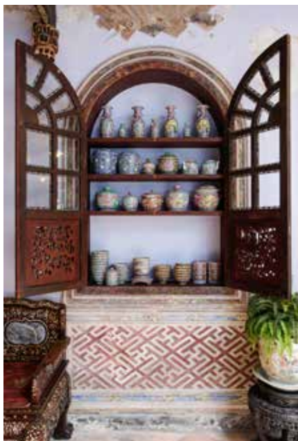
Recessed cabinets ( piaktu ) built into the walls

NUS Baba House is also a "pedagogical facility for teaching", says curator Foo Su Ling. Students of history and architecture enter its doors and are enriched by the diverse perspectives the house offers through academic talks, conservation workshops and more. For instance, talks and workshops on the use of lime during conservation work on the house's walls have been