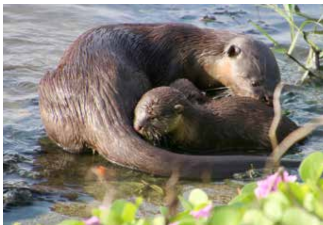
Adult otters closely monitor the pups' first foray into the water

Singapore is probably the only country in the world where you can see otters in broad daylight, right in the very heart of the city. Search the internet and you can find documentaries narrated by Sir David Attenborough, amongst others, with captivating footage of otters swimming in the Singapore River, rolling in the sand on the shores of Marina Reservoir and even parading their pups in Pasir Ris Park.