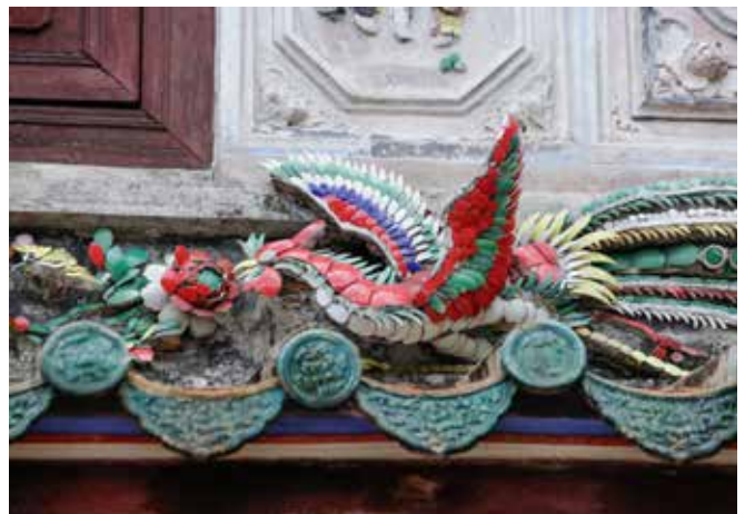
Phoenix and peony ceramic applique above the cantilever roof

On the interpretative front, the curatorial strategies not only present the house as a restored building, but also ensure that its contents tell a comprehensive story about its inhabitants. That story is situated within a complex matrix of relationships that include urban history, migration, economic contingencies, the neighbourhood, and so on. Therefore, in early 2008, an acquisitions policy was drafted to assemble a world-class collection of objects and materials that would form a substantial resource for the study of Peranakan culture, history and society as a whole. In addition to those from the Wee family, artefacts