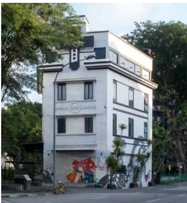
The building just before its demolition