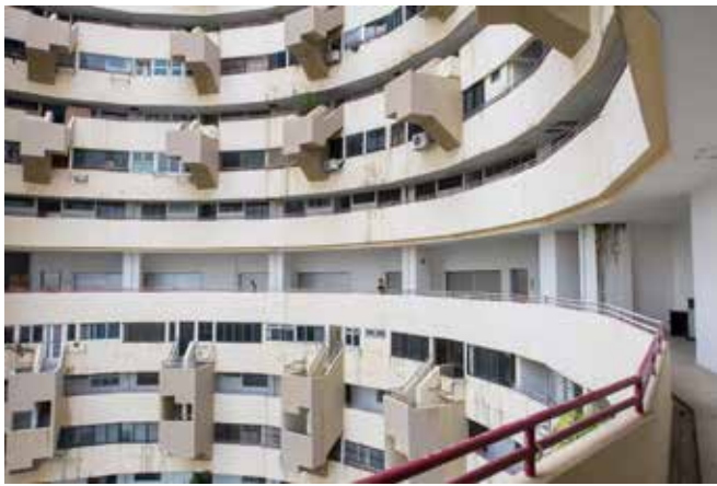
The inside of the circle