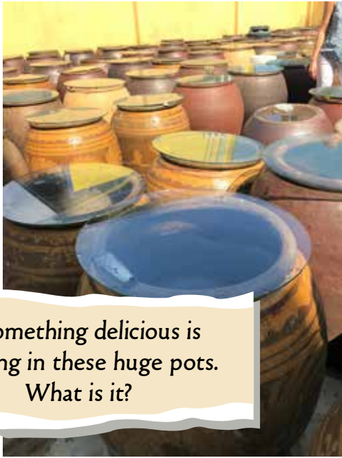
5. Something delicious is brewing in these huge pots. What is it?