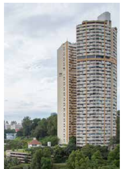
A view of the block taken from the former Pearls Centre

The 38-storey apartment block also had problems with its lifts, post completion. For over a month in 1978, only two of the lifts were in working order. Another incident that