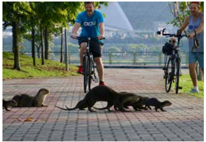
Cyclists giving way to a family of otters crossing the path around Marina Reservoir

In 1998 two smooth-coated otters were spotted in Sungei Buloh, in the north of the island. It's likely that they swam across the strait from Johor, escaping the same conditions which had led to the otters' demise in Singapore in the 1960s.