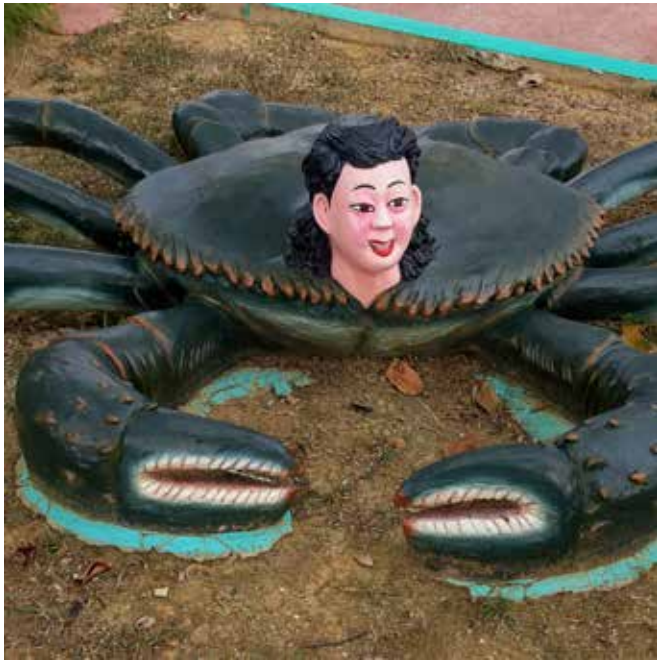
One of Haw Par Villa's many fantastical creatures

To enter Haw Par Villa is to enter another dimension. Meandering pathways lead you among vibrantly coloured statues that depict Chinese myths and cautionary tales. Fantastical creatures greet you as you turn a corner while big band music plays over crackling speakers mounted on poles. There is nothing else like Haw Par Villa in Singapore or, for that matter, the world.