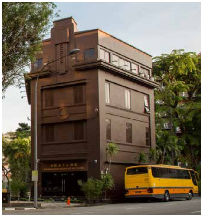
The building in 2015 - then used by the Tea Culture Academy

Catholic Diocese of Penang's first bishop, serving from 1955 to 1967.