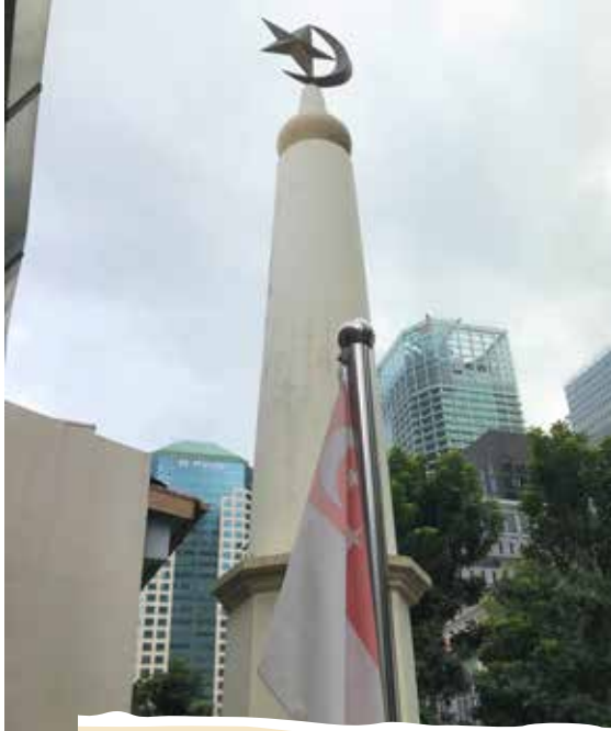
6. Atop which building do you get this view?