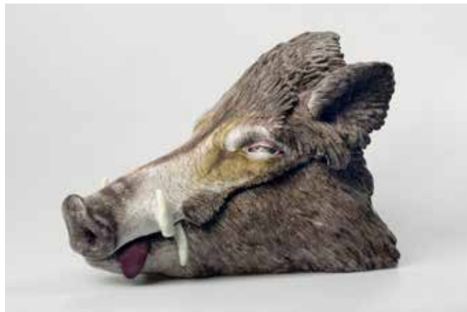
This boar's head tureen is from Niderviller, France. What made these pieces revolutionary at the time, was the purple (pourpre in French) glaze for the tongue and mouth, a process developed by Paul Hannong

warfare...". Game hunting was the privilege of the nobility, the boar the most dangerous animal to hunt, the realistic looking tureen the trophy piece of the service à la française .