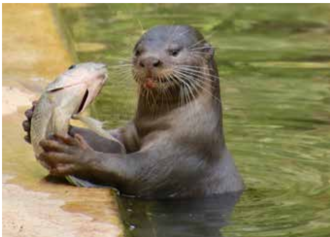
"OK, if you've taken the shot then I can get on with breakfast!"

Those otters thrived in the mangrove-forested nature reserve and before long, pups appeared. With time, other otters were spotted around Singapore and in 2014 a pair took up residence in Bishan Park, where they had a litter of three pups. This was the start of the famous "Bishan family of otters". The following year they moved down the Kallang River and into Marina Reservoir. This family still live in this patch of Singapore and is quite possibly one of the most closely documented and most-photographed group of wild otters in the world.