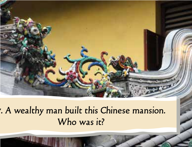
7. A wealthy man built this Chinese mansion. Who was it?