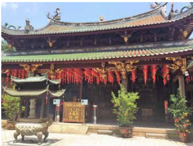
Religious buildings along Telok Ayer Bay